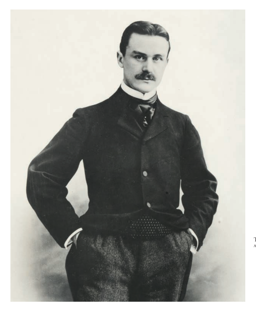
Thomas Mann, Munich, 1900

3. The exhibition is, at the same time, an attempt to contribute to political education as a key to social participation by linking the biographical-historical exhibition about the author with current sociopolitical issues in Germany and the U.S.